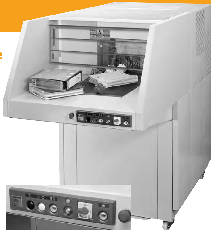
Easy to use control panel with optical indicators, push buttons for stand-by/stop/reverse and emergency stop button.

**Two shred speeds. Speed will decrease slightly in "Power" mode. Capacity will decrease slightly in "Speed" mode.