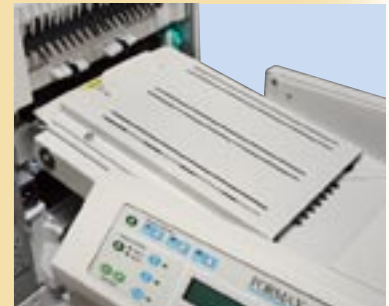
Enclosed paper path provides optimal document security

The FD 2052IL sets a new standard as the first heavy-duty tabletop pressure sealer capable of running in-line with laser printers. The FD 2052IL processes up to 175,000 forms per month in a compact and powerful design. The user-friendly control panel features LED indicators and a six-digit resettable counter.