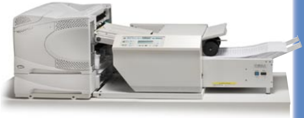
FD 2052IL System shown with IL Pressure Sealer and IL Alignment Base, laser printer (not included), optional conveyor and optional locking cabinets